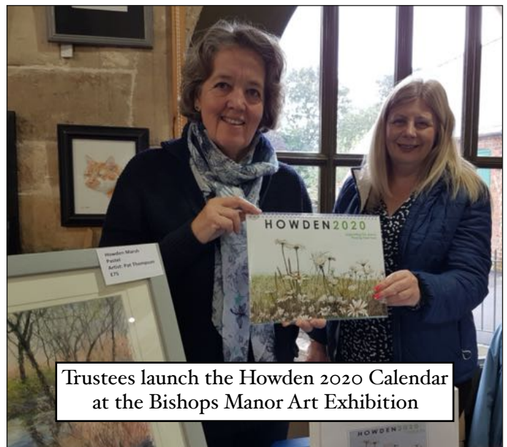
Trustees launch the Howden 2020 Calendar at the Bishops Manor Art Exhibition

...Published by the Ashes Playing Field Trust, is on sale now for just £5. Featuring the work of 5 local artists the calendar is fun and great for giving a clear overview of the year with space to write in those important events. An excellent Christmas gift! Calendars can be purchased in the following local shops – Chappelow's Newsagents, Parkin's Butchers, That Tea Room, Jo Mahoney, Shire Hall Office and California Gardens. Please buy one and support The Ashes Development Fund.