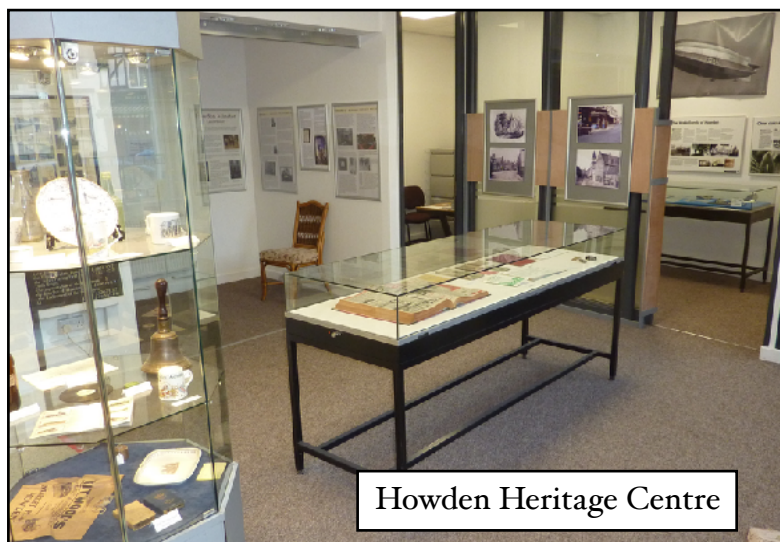
Howden Heritage Centre

c/o The Shire Hall, Market Place, Howden, DN14 7BJ.