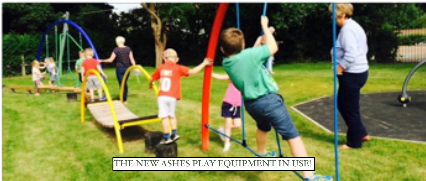
THE NEW ASHES PLAY EQUIPMENT IN USE!